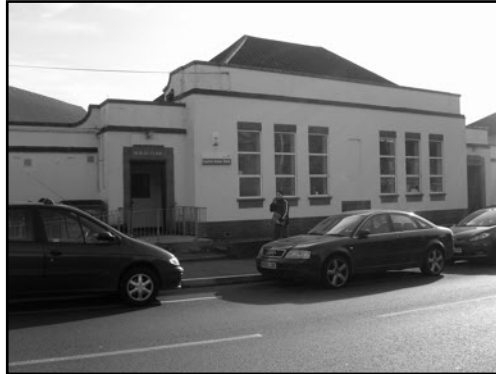
Leyton Green Clinic

The Focus Team says: The clinic provides a vital service for local people, who will now have to travel long distances.